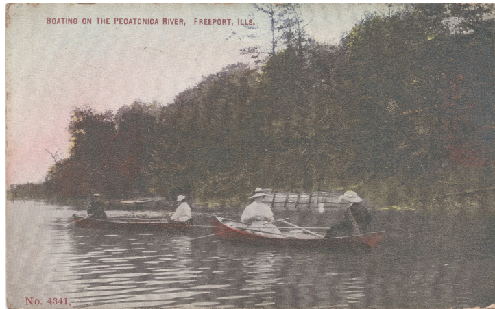
Boating on the Pecatonica, Freeport, Illinois

Please visit our website or contact us for more information, advice, or consultation for individuals & organizations interested in paddling or organizing river events as well as any ideas to improve stewardship of the river.