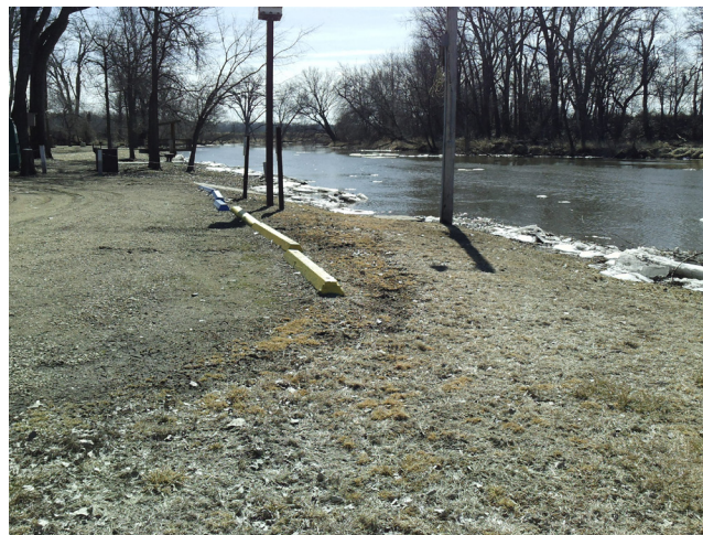
McConnell's Bobtown Landing

Please visit our website or contact us for more information, advice, or consultation for individuals & organizations interested in paddling or organizing river events as well as any ideas to improve stewardship of the river.