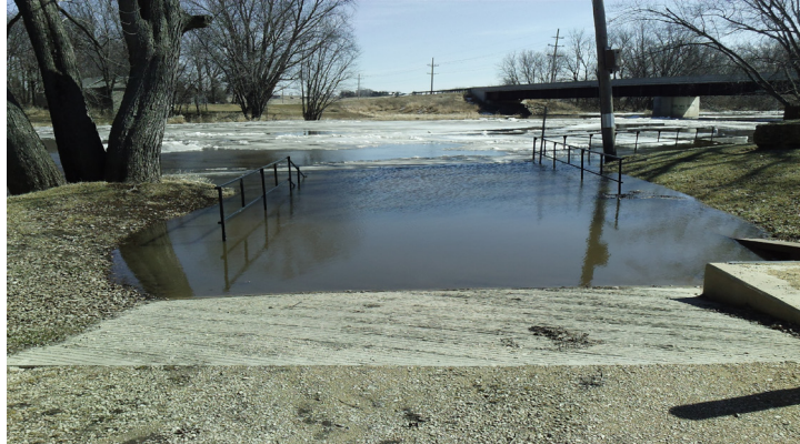
McNeils Damascus Landing

March 28 is FPRF's Spring Thaw event and we hope you will join us. As we look around Freeport, the snow is gone! These pictures will give an idea where it went.