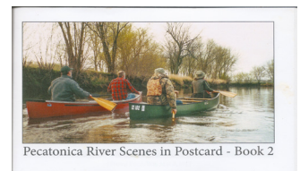
Pecatonica River Scenes in Postcard - Book 2

Pecatonica River Scenes in Postcards $12 +$3 S&H www.pecriver.org/projects